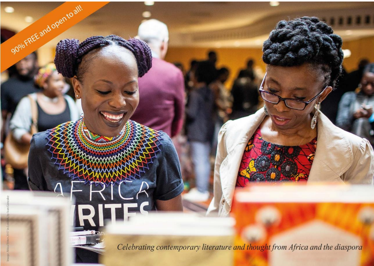
Image: Africa Writes 2017 in London

Celebrating contemporary literature and thought from Africa and the diaspora